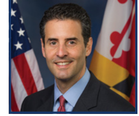
Congressman John Sarbanes

I hope that you and your family are keeping safe and staying healthy during this difficult time. In the face of many challenges, I am confident we will emerge a stronger, fairer and more unified country.